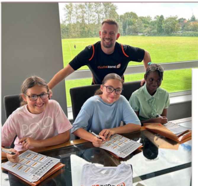
LFE SUMMER CAMP FIRST DAY OF THE COACHING ACADEMY PROGRAMME 2023

OUR COACHING ACADEMY YOUNG LEADERS HAD A FANTASTIC SUMMER MAKING FRIENDS AND LEARNING TO COACH WHILST DEVELOPING THEIR CONFIDENCE AND COMMUNICATION SKILLS.