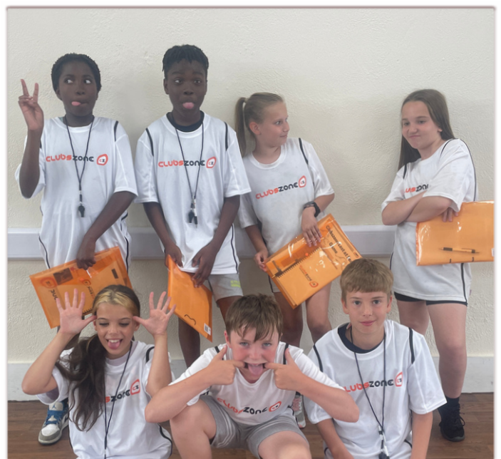
SYSTON SUMMER CAMP LAST DAY OF THE COACHING ACADEMY PROGRAMME 2023